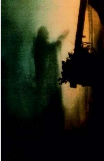
Not doctored picture of Jesus in the clouds